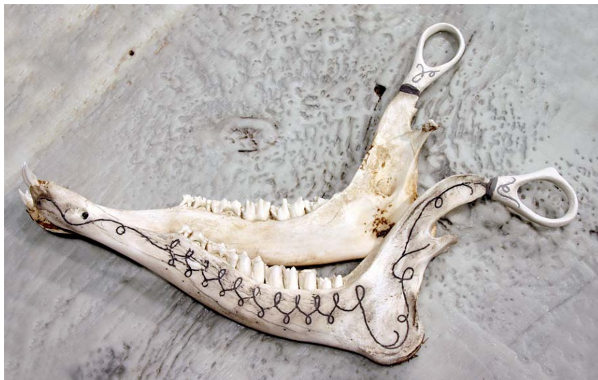
Julie Wills, Scissor , 2006, jawbone, porcelain, mixed media 12 x 8 x 2 in.

Auraria Campus - Box 177 PO Box 173364 - Denver, CO 80217-3364 Phone: 303-556-8337 Fax: 303-556-2335