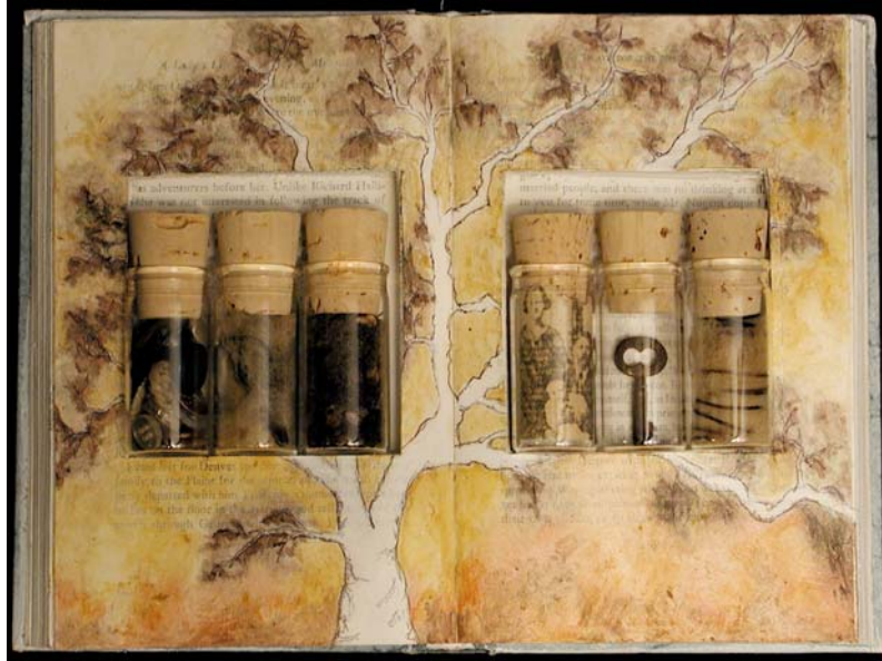
Irene E.F. Keeley, Stories , 2007, mixed media, 11 x 14 in, Image Courtesy of the Artist.