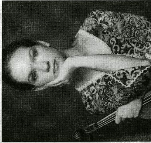
Violinist Hilary Hahn joins the Aspen Chamber Symphony Friday evening.

" Mystery! " at 9 p.m. on Channel 6 features "Inspector Lewis," starring Kevin Whately and Laurence Fox. While everything else is in reruns, Inspector Robert Lewis and his younger colleague investigate the death of an American college student. Inspector Morse is gone, but five years later his former sidekick is now policing the English university city of Oxford.